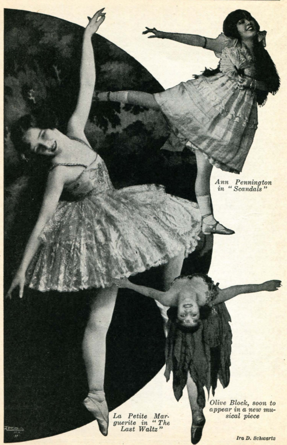
A trio of Broadway terpsichorean favorites in semaphorean poses