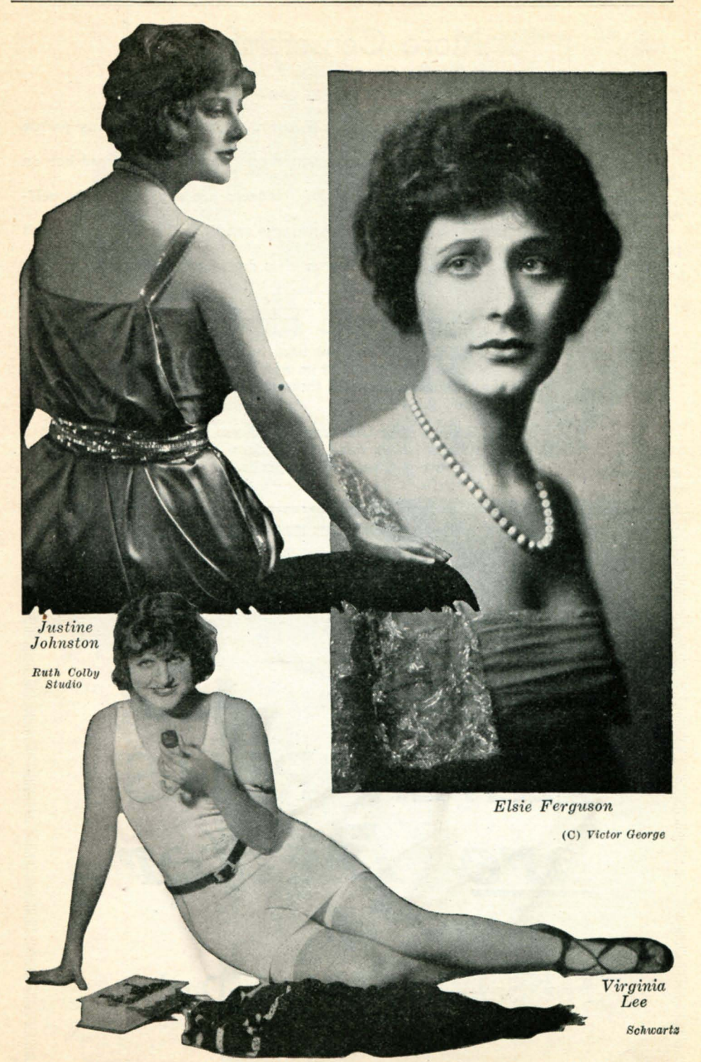
They are seen and heard, off and on, first on the Screen then on the Stage