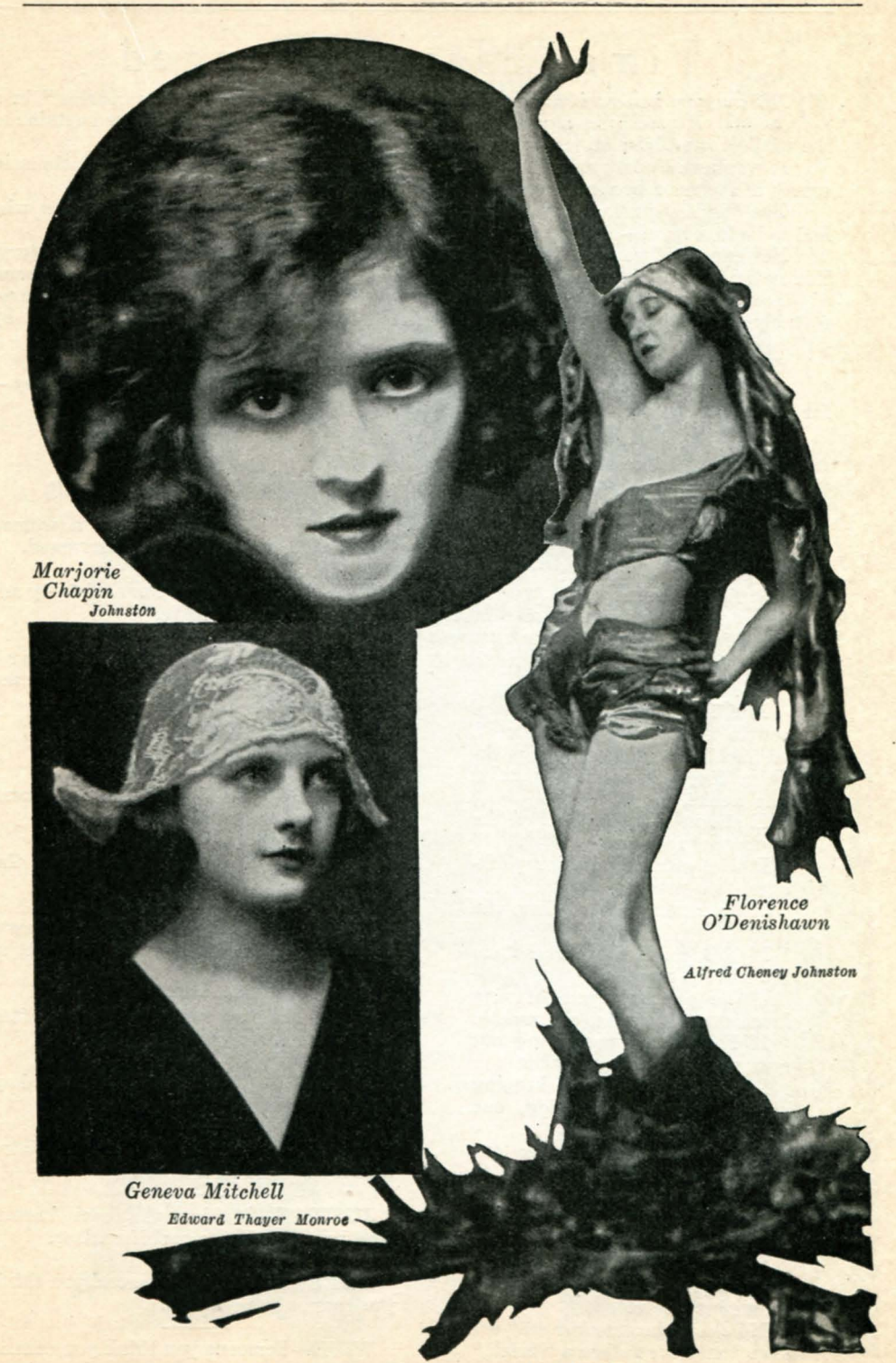
Fair Faces and Forms in the "Follies"